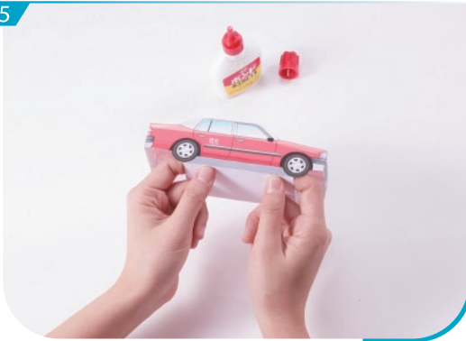
Finally, glue the tab. Taxi is now done!