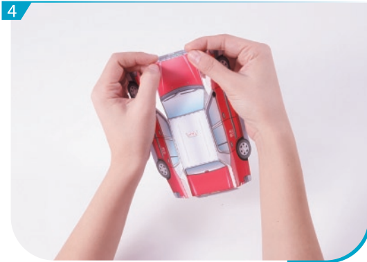
Fold the taxi along the lines.