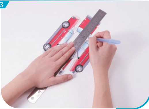
Use a pen whose ink has dried out, or a tracer, to trace the lines.