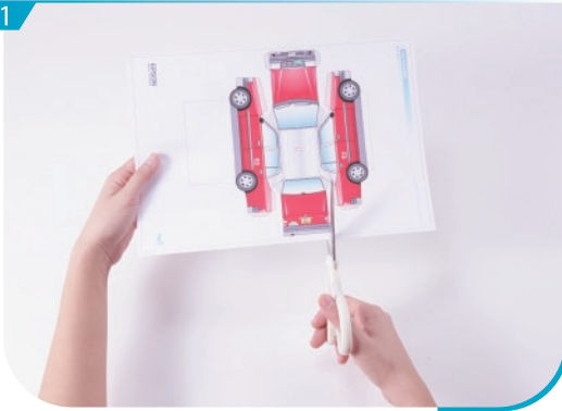
Cut the taxi along the line.