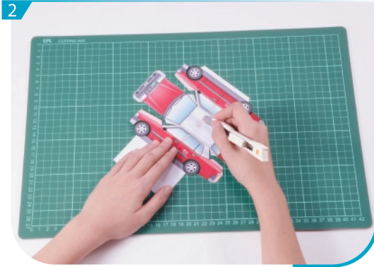
Make cuts along all the black lines at the roof.